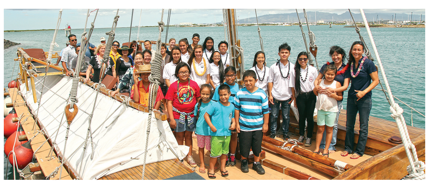
Students, education leaders and Polynesian Voyaging Society crewmembers aboard the Hikianalia at the Marine Education Training Center, Honolulu.

Decrease in number of students remediated in English who are enrolled in the UH System.